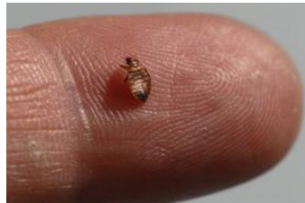
Actual size of a bedbug