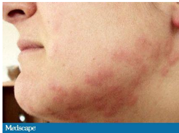
Bedbug bites on the face