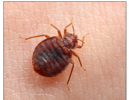
A bedbug on exposed human skin